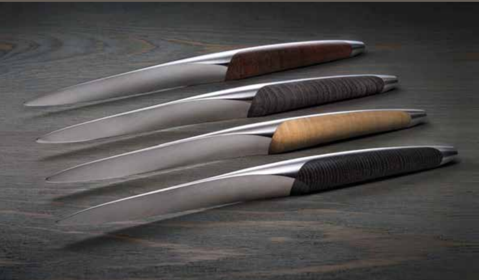
Table knife set – CHF 956.00 (walnut, grey, light and dark ash)

In addition to the black ash and walnut standard versions we also offer an assorted set of 4 table or steak knives with 4 different wooden handles.